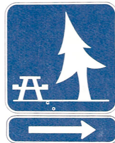
D5-5a 24" x 24" 24" x 6"